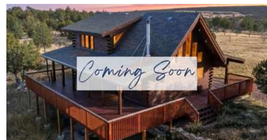
250 Acres in Pueblo, CO