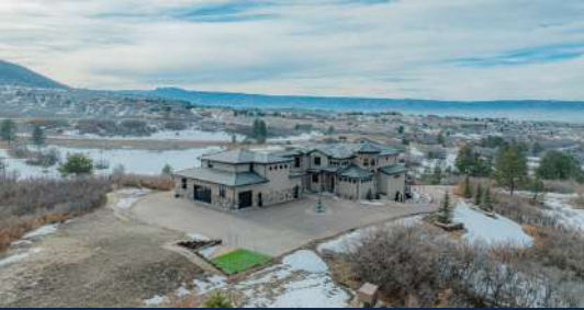
3520 Castle Butte Drive Castle Rock, CO 80109