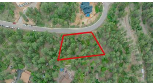
648 Copper Fox Place Larkspur, CO 80118