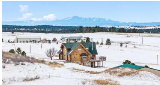
39980 Fox Trot Circle Elizabeth, CO 80107