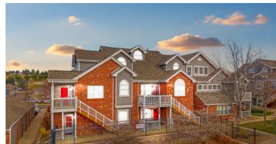
E Fremont Avenue Condos (3 Available) Aurora, CO 80016