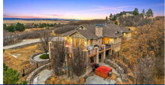
1283 Glade Gulch Road Castle Rock, CO 80104