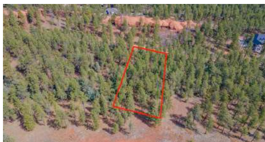
8257 Bannock Drive Larkspur, CO 80118