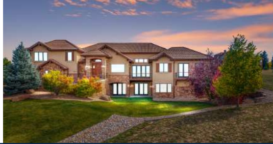
1548 Amber Court Castle Rock, CO 80108