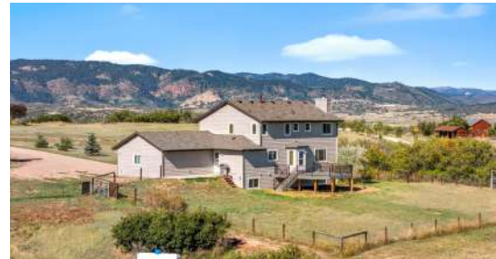
360 Sly Fox Way Sedalia, CO 80135