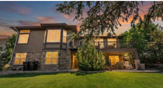
5127 Mining Camp Trail Parker, CO 80134