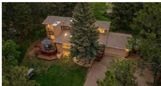
1540 Fawnwood Road Monument, CO 80132