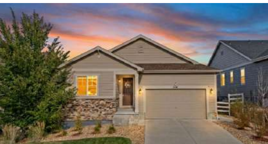
5740 Berry Ridge Way Castle Rock, CO 80104