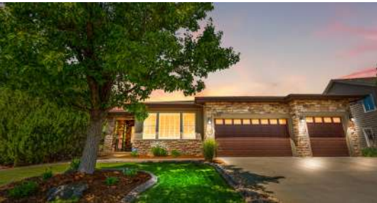
5127 Mining Camp Trail Parker, CO 80134