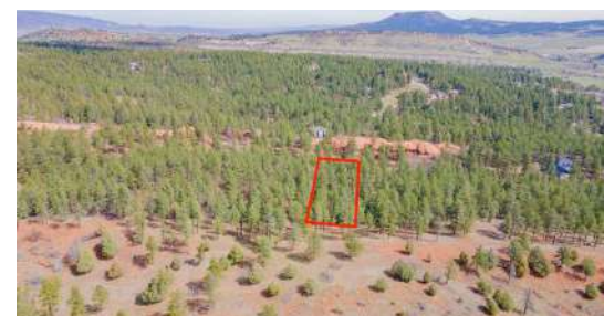
8253 Bannock Drive Larkspur, CO 80118