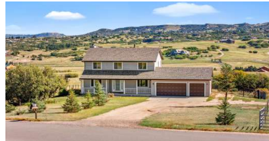
360 Sly Fox Way Sedalia, CO 80135