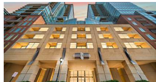
1700 Bassett Street #823 Denver, CO 80202