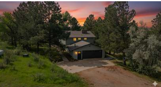
9212 Tanglewood Road Franktown, CO 80116