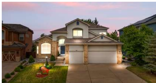
1362 Double Eagle Court Castle Rock, CO 80104