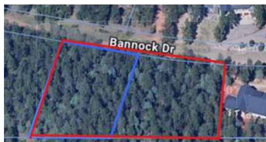
8257 Bannock Drive Larkspur, CO 80118