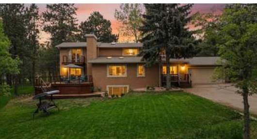
1540 Fawnwood Road Monument, CO 80132