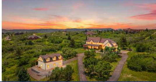
1091 Colt Circle Castle Rock, CO 80109