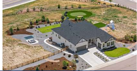
5598 Missoula Trail Castle Rock, CO 80108