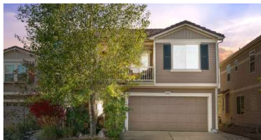
3868 Alcazar Drive Castle Rock, CO 80109