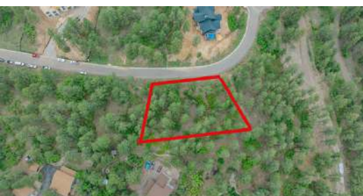
648 Copper Fox Place Larkspur, CO 80118