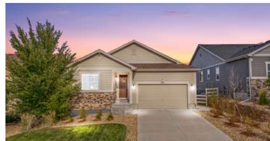
5740 Berry Ridge Way Castle Rock, CO 80104