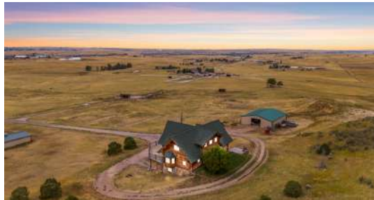
39980 Fox Trot Circle Elizabeth, CO 80107