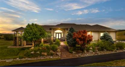
3358 Castle Butte Drive Castle Rock, CO 80109