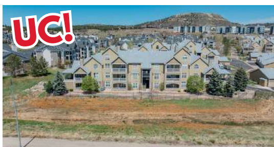
6017 Castlegate Drive #F15 Castle Rock, CO 80108