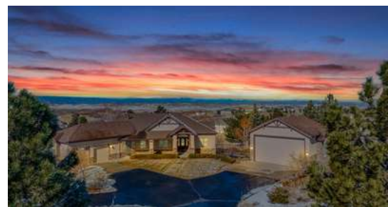
3535 Medallion Road Castle Rock, CO 80104