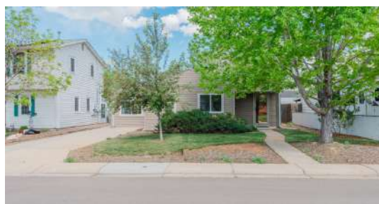
4480 S Pennsylvania Street Englewood, CO 80113