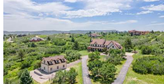
1091 Colt Circle Castle Rock, CO 80109