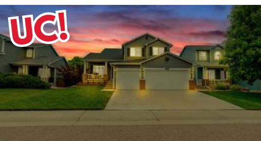
9884 Sydney Lane Highlands Ranch, CO 80130