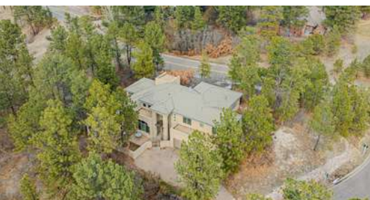
209 Saratoga Mine Drive Castle Rock, CO 80108