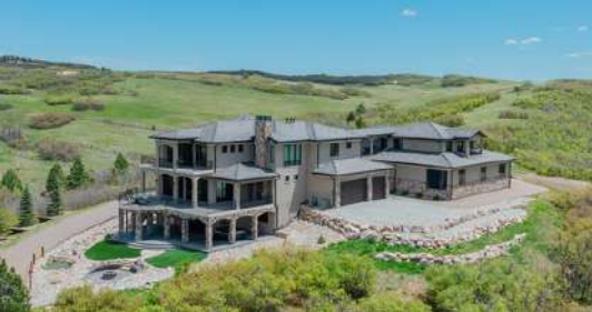
3520 Castle Butte Drive Castle Rock, CO 80109