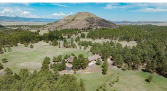
3842 Estates Circle Larkspur, CO 80118