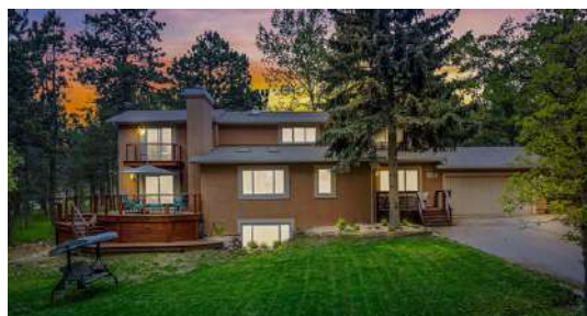
1540 Fawnwood Road Monument, CO 80132