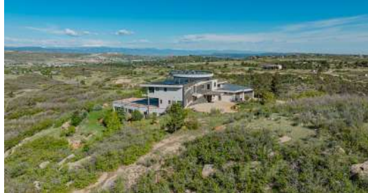
1175 Ridge Oaks Drive Castle Rock, CO 80104