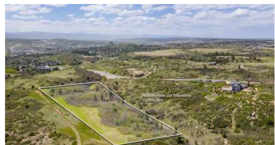
SE Plum Creek Parkway Castle Rock, CO 80104