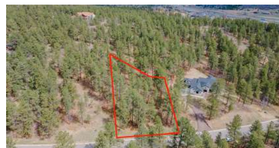
773 Copper Fox Place Larkspur, CO 80118