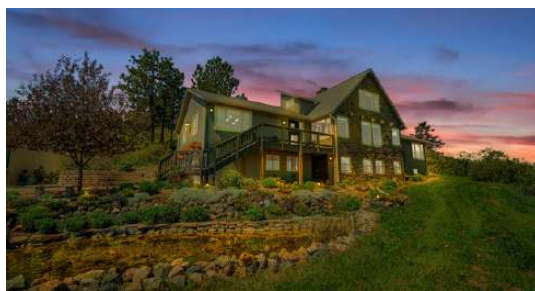
1549 Hillside Circle Sedalia, CO 80135