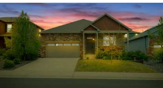
5741 Echo Park Circle Castle Rock, CO 80104