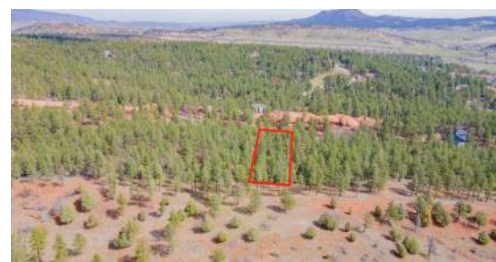
8253 Bannock Drive Larkspur, CO 80118