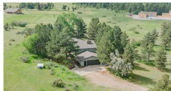
9212 Tanglewood Road Franktown, CO 80116