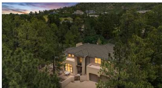
209 Saratoga Mine Drive Castle Rock, CO 80108