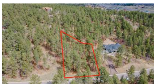
773 Copper Fox Place Larkspur, CO 80118