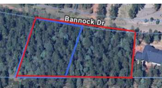
8257 Bannock Drive Larkspur, CO 80118