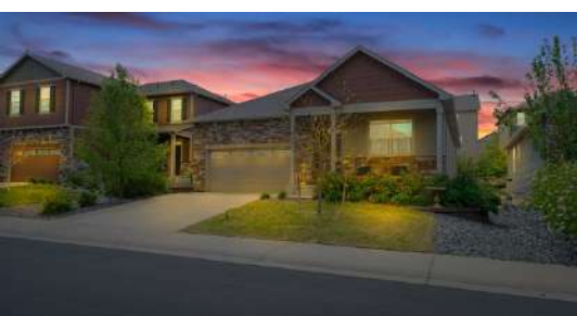
5741 Echo Park Circle Castle Rock, CO 80104