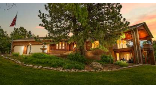
8662 Kim Court Parker, CO 80134