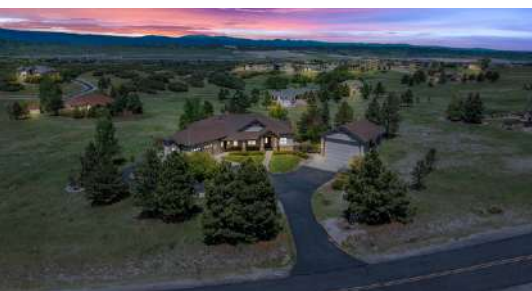
3535 Medallion Road Castle Rock, CO 80104