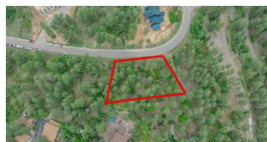
648 Copper Fox Place Larkspur, CO 80118