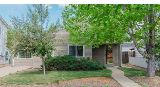
4480 S Pennsylvania Street Englewood, CO 80113