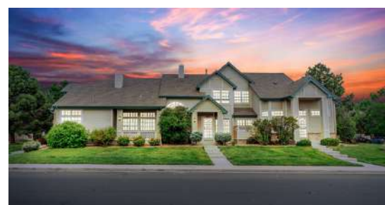
10087 E Hawaii Place Aurora, CO 80247