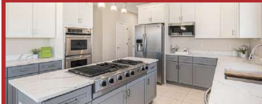
4598 High Spring Road Castle Rock CO 80104