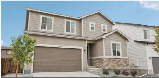
6428 Vista Cliff Loop Castle Rock CO 80104