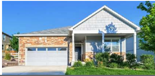
5721 Echo Park Circle Castle Rock CO 80104