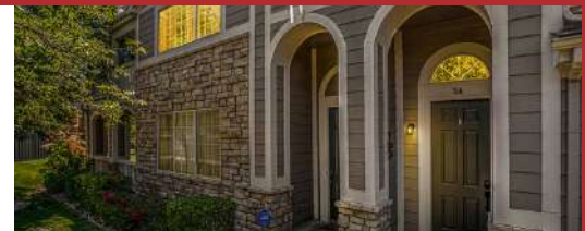
4251 S Blackhawk Circle Unit #3A Aurora, CO 80014