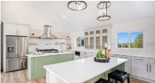
10694 Camelot Drive Franktown CO 80116