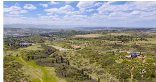
SE Plum Creek Parkway Castle Rock CO 80104