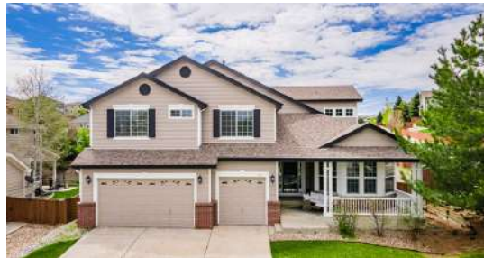
1828 Aquamarine Court Castle Rock CO 80108