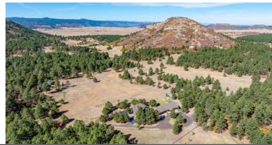
3842 Estates Circle Larkspur CO 80118