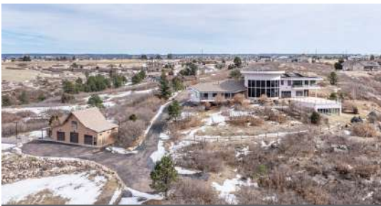
1175 Ridge Oaks Drive Castle Rock CO 80104