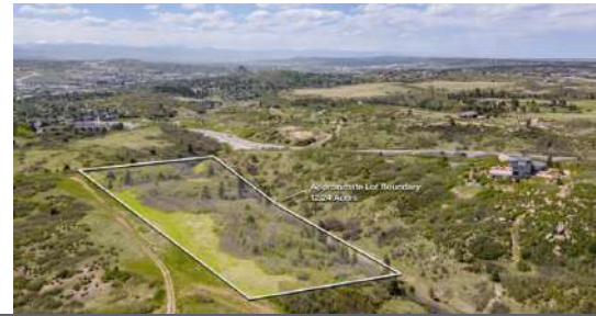
SE Plum Creek Parkway Castle Rock CO 80104