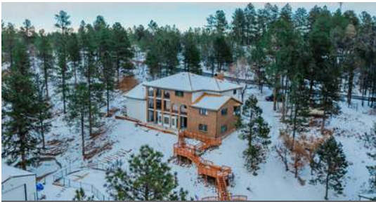
757 Bluff Drive Franktown CO 80116