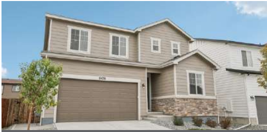
6428 Vista Cliff Loop Castle Rock CO 80104