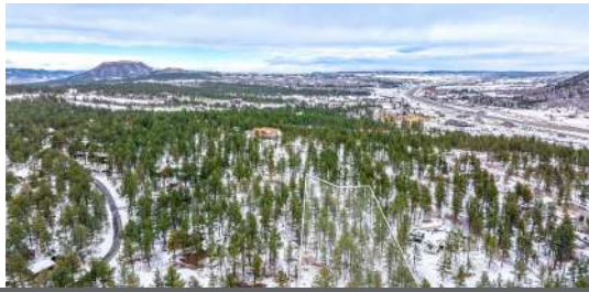
773 Poncho Road Larkspur CO 80118