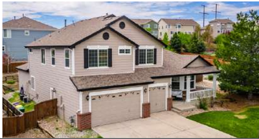
1828 Aquamarine Court Castle Rock CO 80108