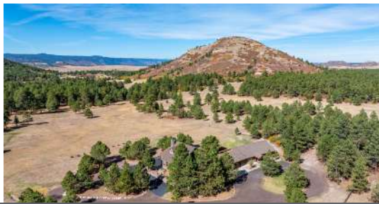
3842 Estates Circle Larkspur CO 80118