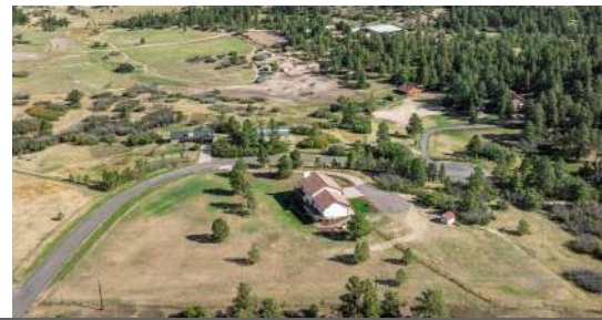
10694 Camelot Drive Franktown CO 80116