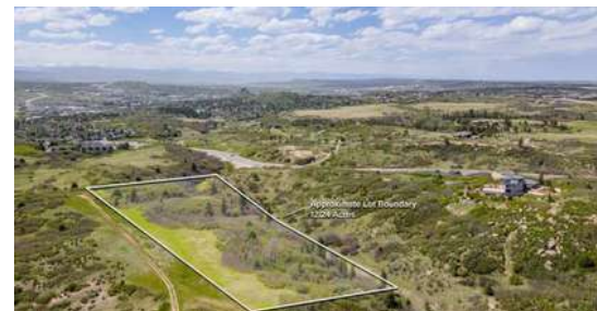
SE Plum Creek Parkway Castle Rock, CO 80104