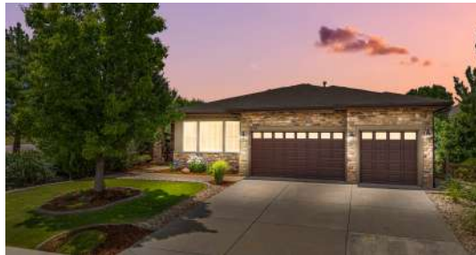
5127 Mining Camp Trail Parker, CO 80134