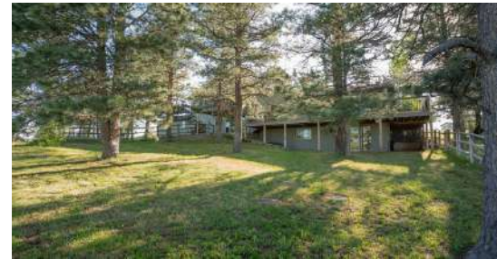
9212 Tanglewood Road Franktown, CO 80116