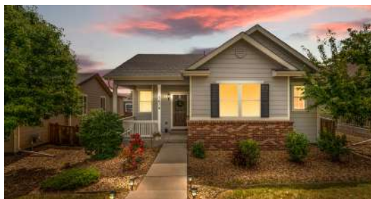
3678 Shadow Circle Castle Rock, CO 80109