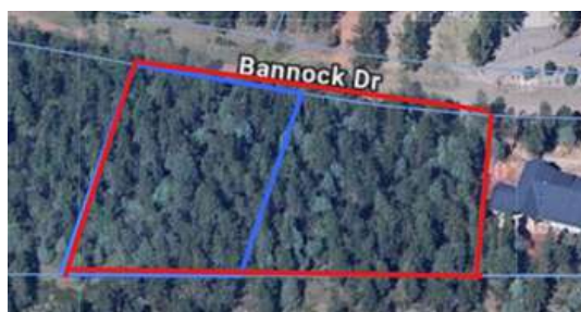
8257 Bannock Drive Larkspur, CO 80118