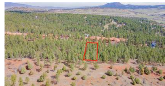
8253 Bannock Drive Larkspur, CO 80118