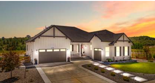
5598 Missoula Trail Castle Rock, CO 80108