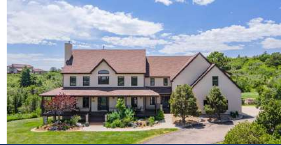
1091 Colt Circle Castle Rock, CO 80109