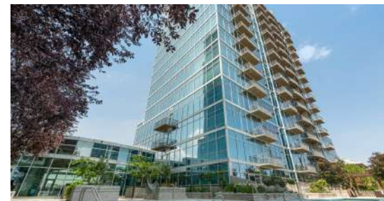
1700 Bassett Street #823 Denver, CO 80202