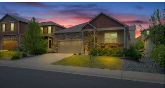
5741 Echo Park Circle Castle Rock, CO 80104