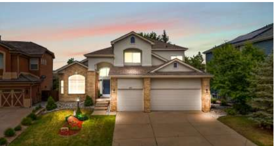
1362 Double Eagle Court Castle Rock, CO 80104