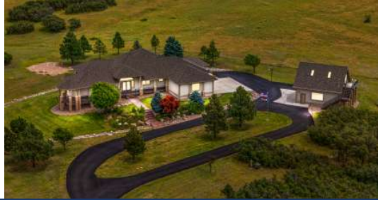
3358 Castle Butte Drive Castle Rock, CO 80109