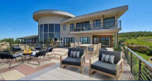
1175 Ridge Oaks Drive Castle Rock, CO 80104