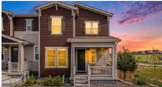
14049 Mock Orange Court Parker CO 80134