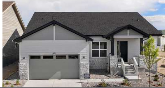
671 Scrubjay Circle Castle Rock CO 80104