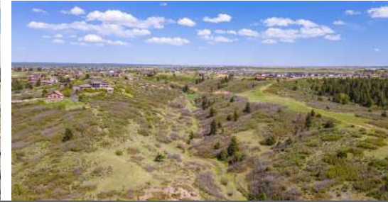
SE Plum Creek Parkway Castle Rock CO 80104