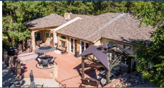
11274 Manitou Road Franktown CO 80116