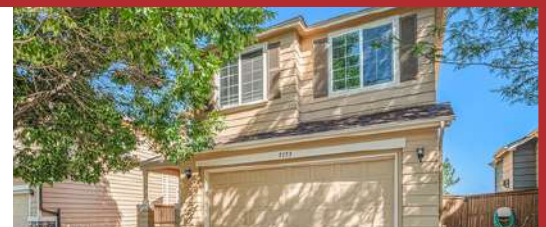
5253 Wangaratta Way, Highlands Ranch, CO 80130