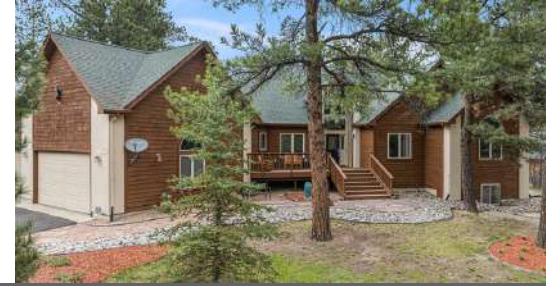
7149 Boreas Road Larkspur CO 80118