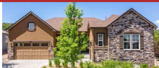
3903 Old Oaks Street Castle Rock CO 80104