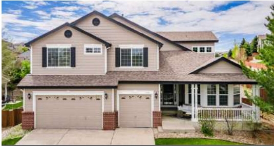
1828 Aquamarine Court Castle Rock CO 80108