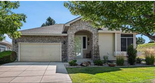
2059 June Court Castle Rock CO 80104