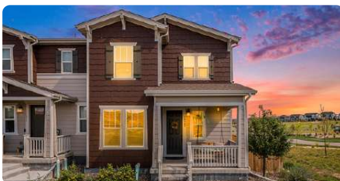
14049 Mock Orange Court, Castle Rock, CO 80104