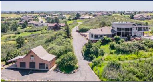
1175 Ridge Oaks Drive Castle Rock CO 80104