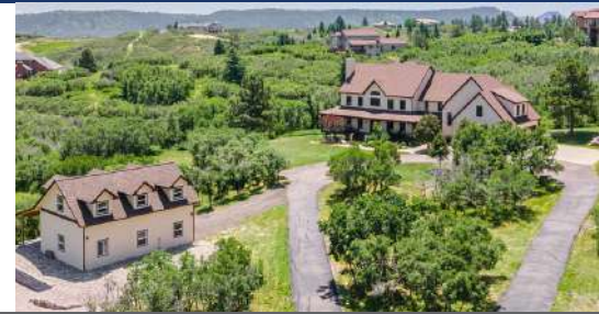
1091 Colt Circle Castle Rock CO 80109