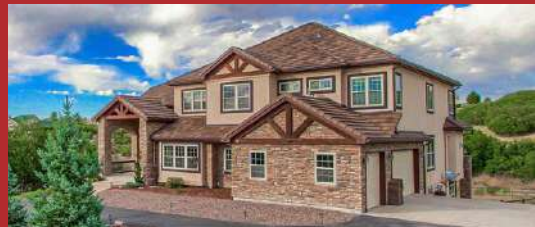
2205 Stevens Court Castle Rock CO 80109