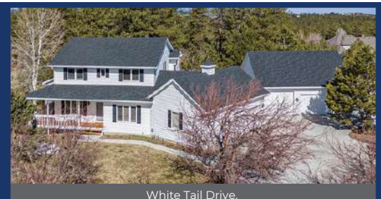
White Tail Drive, Franktown CO 80116