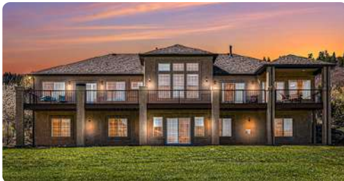
4598 High Spring Road, Castle Rock, CO 80104