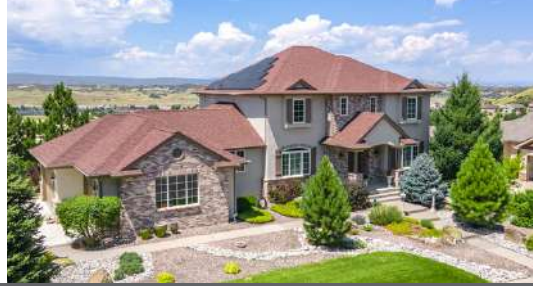
4469 Lions Paw Street Castle Rock CO 80104