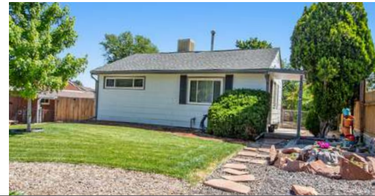
1570 Shoshone Street Denver CO 80223