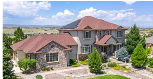
4469 Lions Paw Street, Castle Rock, CO 80104