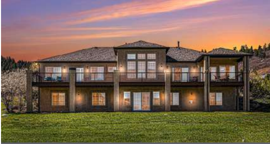
4598 High Spring Road Castle Rock CO 80104