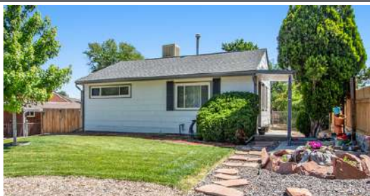
1570 Shoshone Street Denver CO 80223