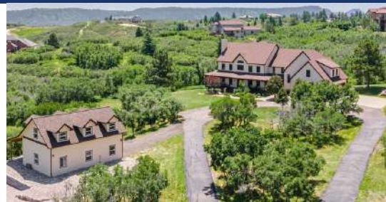
1091 Colt Circle Castle Rock CO 80109