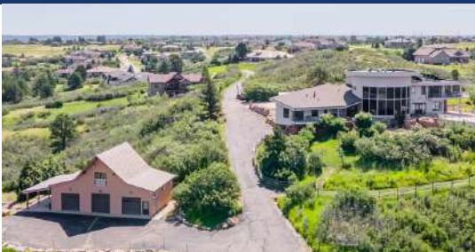
1175 Ridge Oaks Drive Castle Rock CO 80104