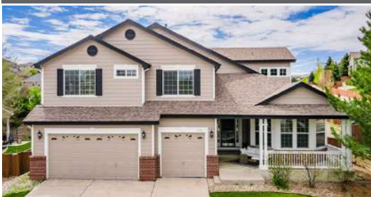
1828 Aquamarine Court Castle Rock CO 80108