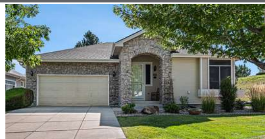
2059 June Court Castle Rock CO 80104