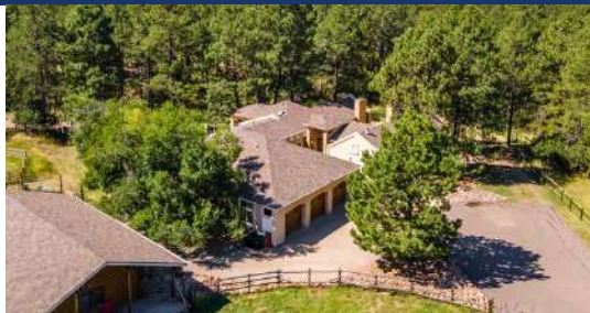
11274 Manitou Road Franktown CO 80116