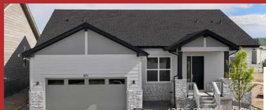
671 Scrubjay Circle Castle Rock CO 80104