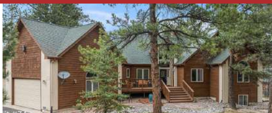
7149 Boreas Road Larkspur CO 80118