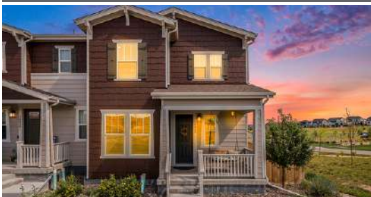
14049 Mock Orange Court Parker CO 80134