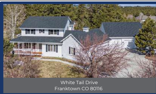
White Tail Drive Franktown CO 80116