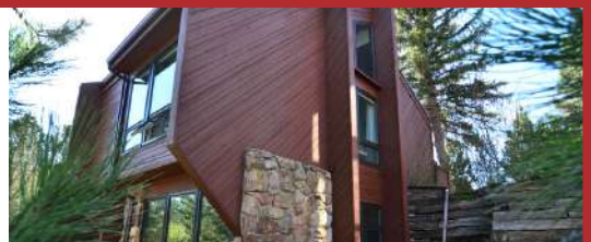
4453 Sentinel Rock Larkspur CO 80118