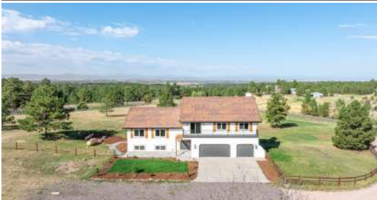
10694 Camelot Drive Franktown CO 80116