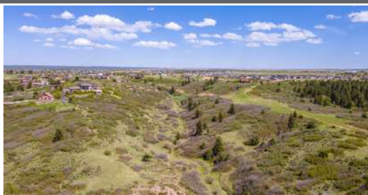
SE Plum Creek Parkway Castle Rock CO 80104