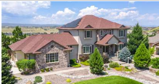
4469 Lions Paw Street Castle Rock CO 80104