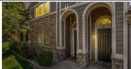
4251 S Blackhawk Circle Unit #3A Aurora, CO 80014