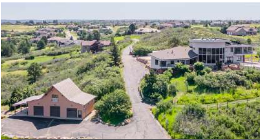
1175 Ridge Oaks Drive Castle Rock CO 80104