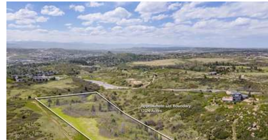
SE Plum Creek Parkway Castle Rock CO 80104