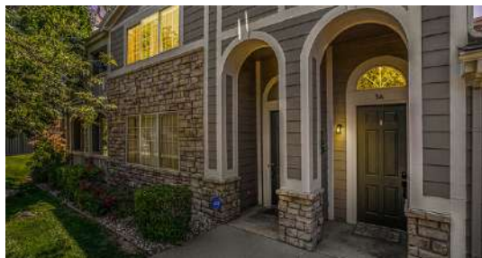
4251 S Blackhawk Circle Unit #3A Aurora, CO 80014