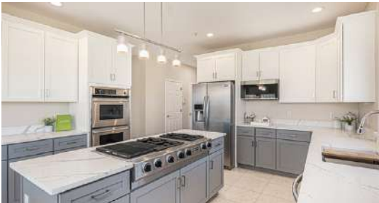
4598 High Spring Road Castle Rock CO 80104