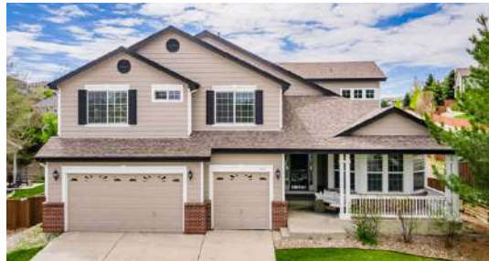
1828 Aquamarine Court Castle Rock CO 80108