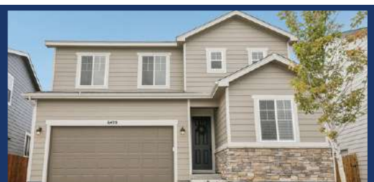
6428 Vista Cliff Loop Castle Rock CO 80104