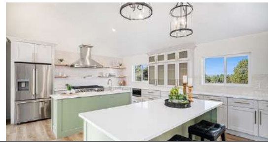
10694 Camelot Drive Franktown CO 80116