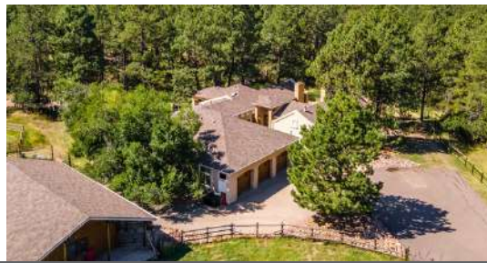
11274 Manitou Road Franktown CO 80116