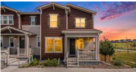
14049 Mock Orange Court Parker CO 80134