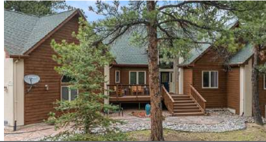
7149 Boreas Road Larkspur CO 80118