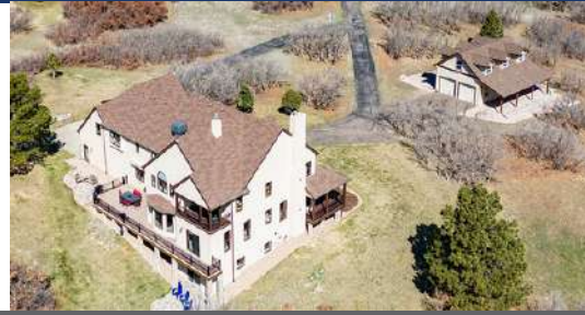
1091 Colt Circle Castle Rock CO 80109