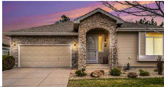
2059 June Court Castle Rock CO 80104