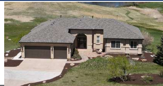
4598 High Spring Road Castle Rock CO 80104