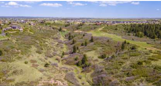
SE Plum Creek Parkway Castle Rock CO 80104