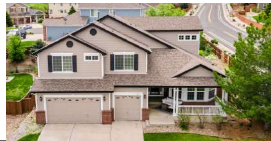
1828 Aquamarine Court Castle Rock CO 80108