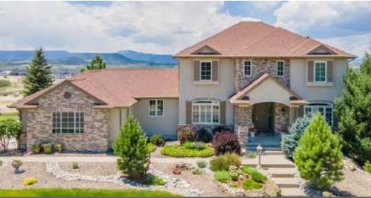
4469 Lions Paw Street Castle Rock CO 80104