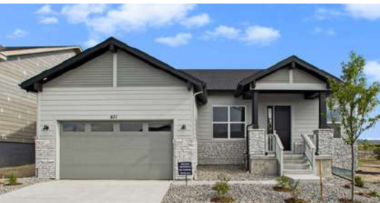
671 Scrubjay Circle Castle Rock CO 80104