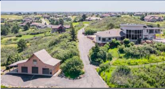
1175 Ridge Oaks Drive Castle Rock CO 80104