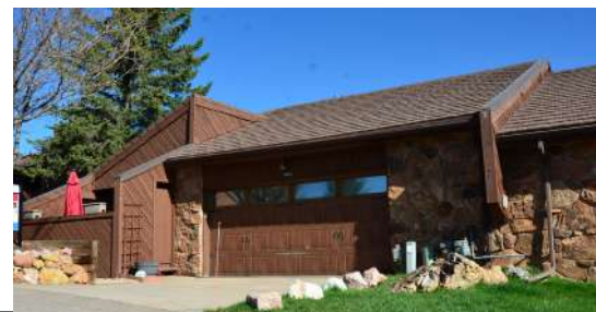
4453 Sentinel Rock Larkspur CO 80118